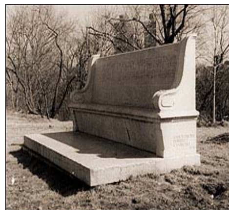
Andrew Haswell Green Memorial Bench in Central Park