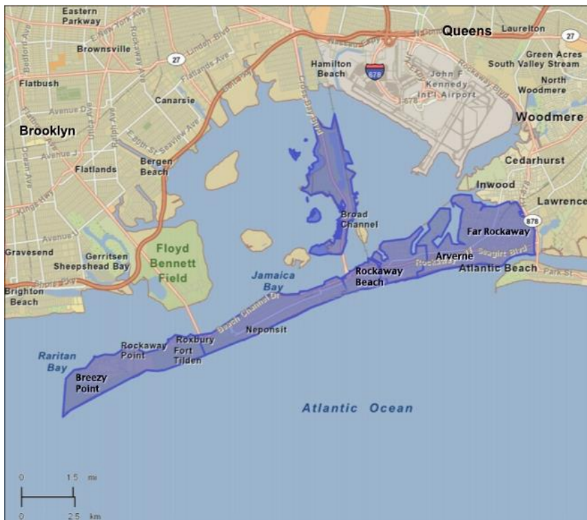
Map 1: The Rockaway peninsula is part of Queens, NY and is situated along the Atlantic Ocean, fewer than 20 miles from Manhattan.

A presence in Rockaway since 1978, RDRC, a community development corporation, promotes Rockaway businesses and community development throughout the peninsula. When Superstorm Sandy hit, RDRC sprung into action. Superstorm Sandy displaced or damaged nearly 1,000 businesses in the three commercial corridors represented by RDRC. The historic storm event underscored the need for RDRC, but overwhelmed the capacity of organization. To determine the best way for the area to move forward with the recovery process, APA-NYM worked with RDRC to thoroughly assess the challenges, existing resources, and short- and long-term needs of the Rockaway area and to develop a set of recommendations to help guide the recovery process for businesses.